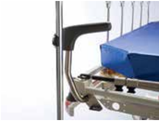
Optional: push handles