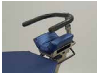
Articulating head section